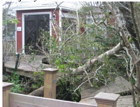
While falling trees seemed to cause the most human casualties, Cherry Grove had few trees down...this one is small, and at Whip-or-will Cottage at the east end of Bayview.