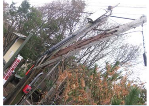
Broken electric pole at Aeon and Lewis...