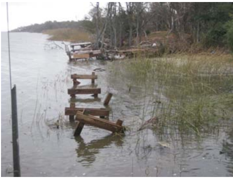
Here was the entrance walk to the Meatrack...looking towards The Pines...