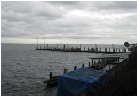
The dock survived...during the storm it was at least under a foot of water...and the poles stayed tied at the Marina!