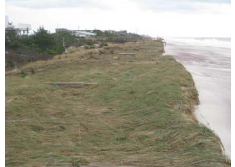
The ocean...note the walk at Aeon...and the missing dunes...they saved us!