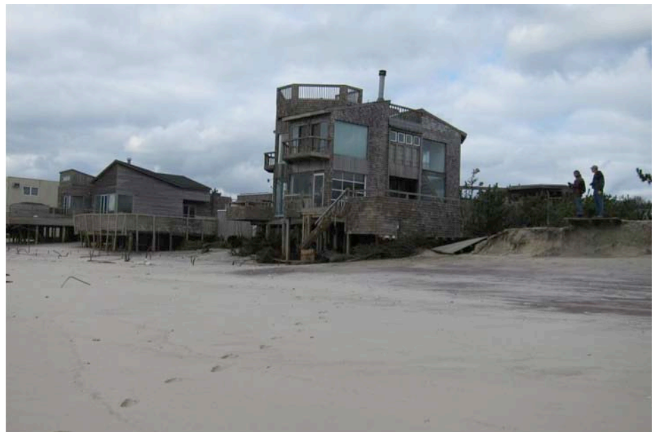
Damage in The Pines (where they have no dunes)