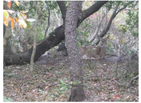
The mama deer rests safely in the Meatrack after the storm...