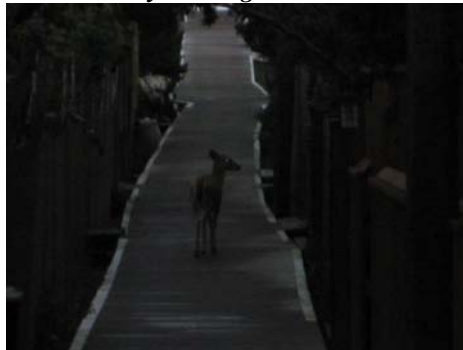
Even the baby deer made it through....the twins that were born so late in the season. Where do they hide out?